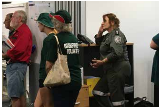
Listening to the IMT brief