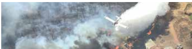
Strickland Road, Adelaide River