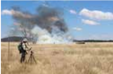
Dr Marta Yebra conducting a grassland fire experiment.

Excerpt of a Bushfire and Natural Hazards CRC article. Complete article can be found at https://www.bnhcrc.com.au/news/2017/can-we-predict-bushfires-space