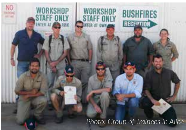
Photo: Group of Trainees in Alice