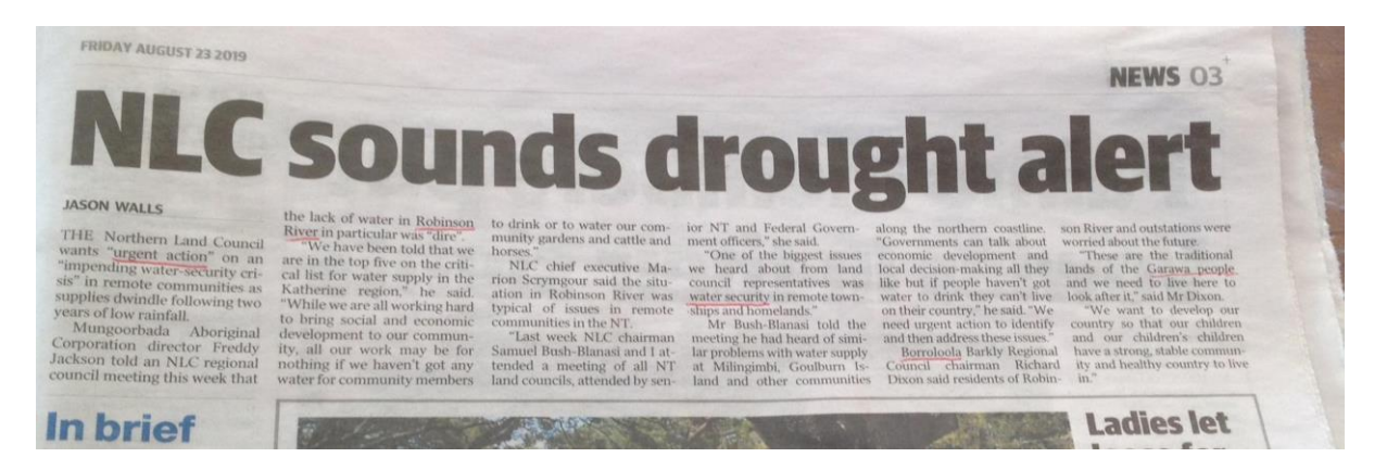
Appendix 1: NLC Sounds drought alert, from the NT News on Friday 23 August 2019.