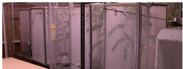
Leuciris breeding colony