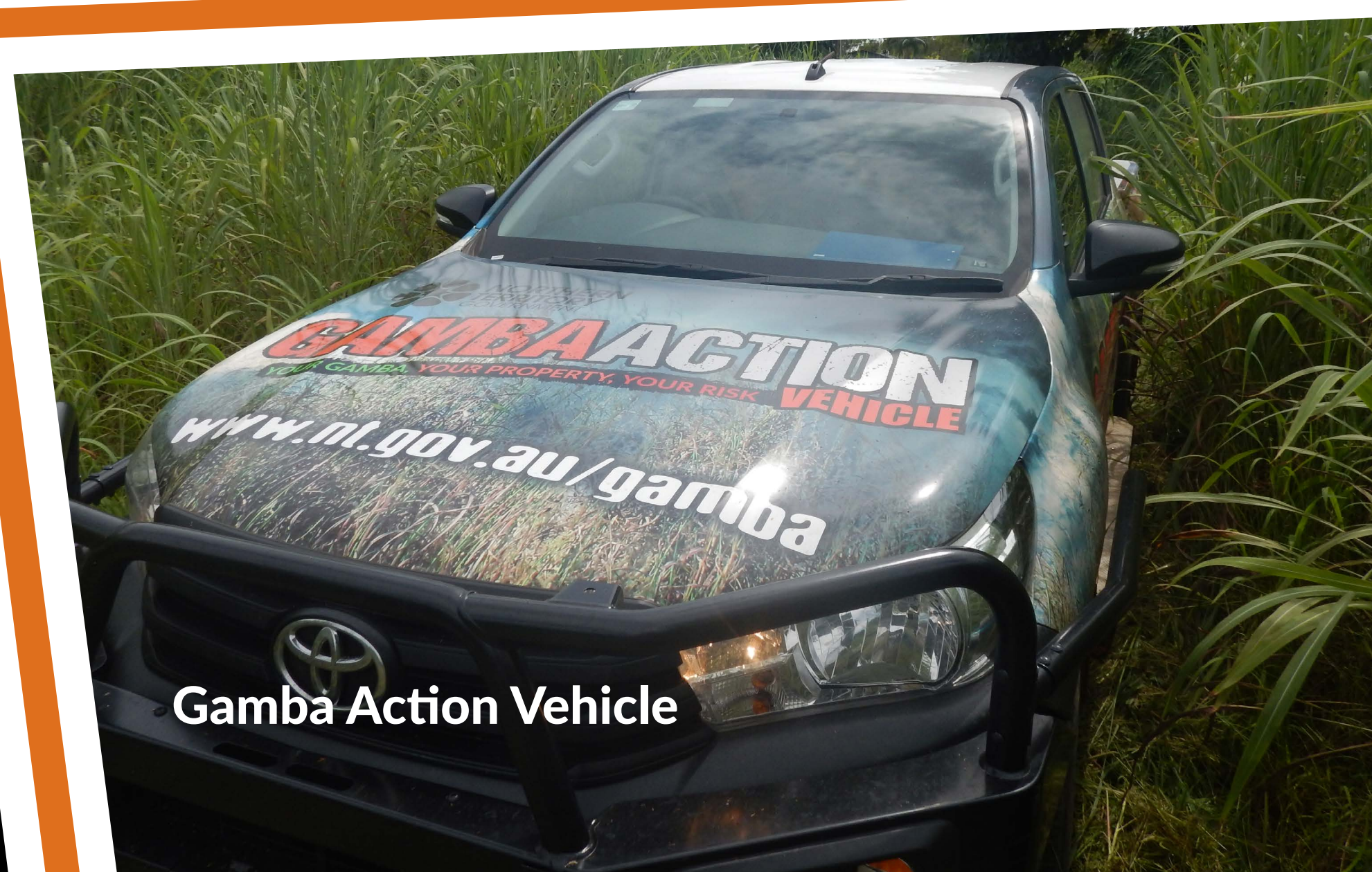
Gamba Action Vehicle

Department of Environment and Natural Resources