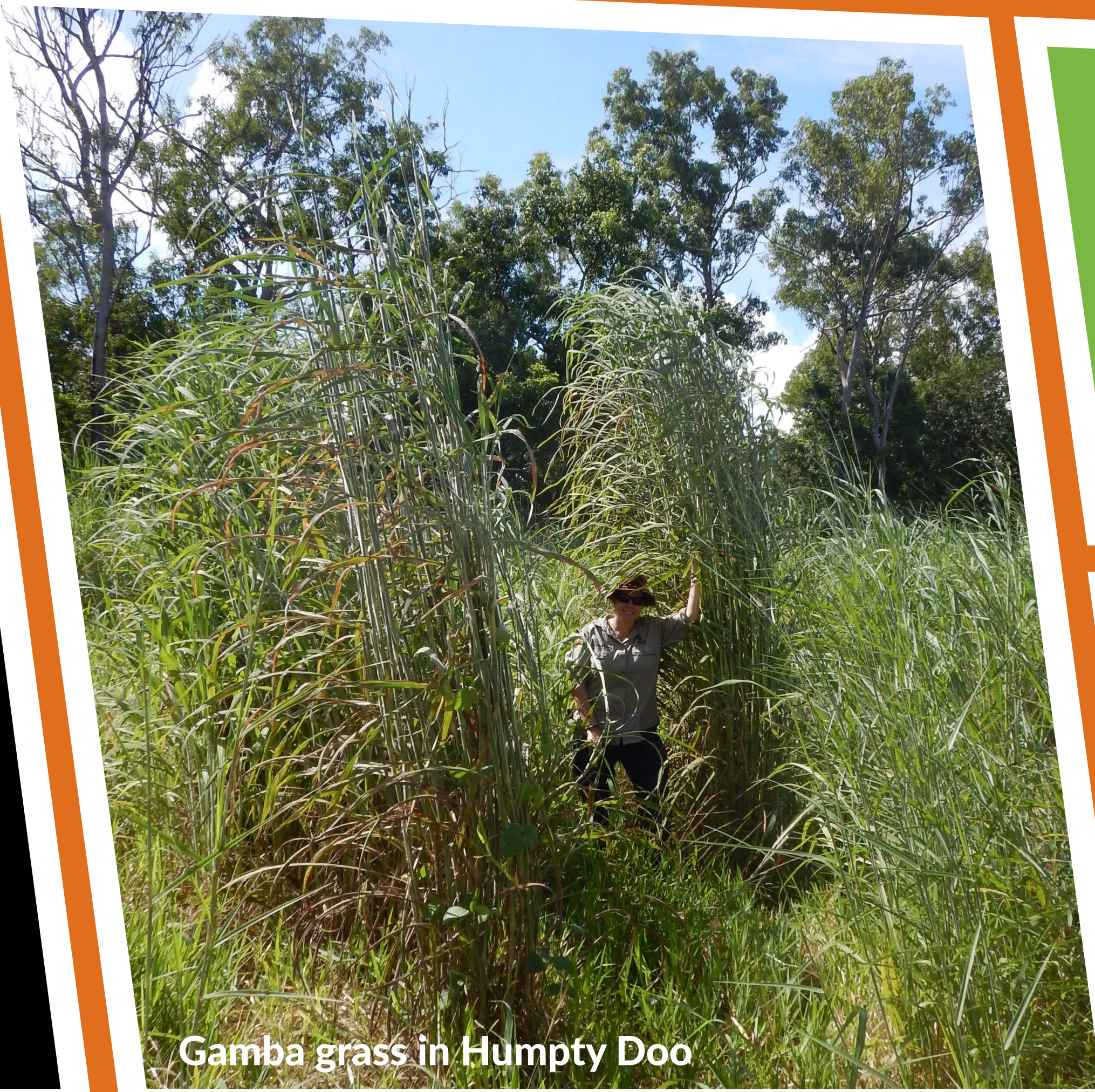
Gamba grass in Humpty Doo