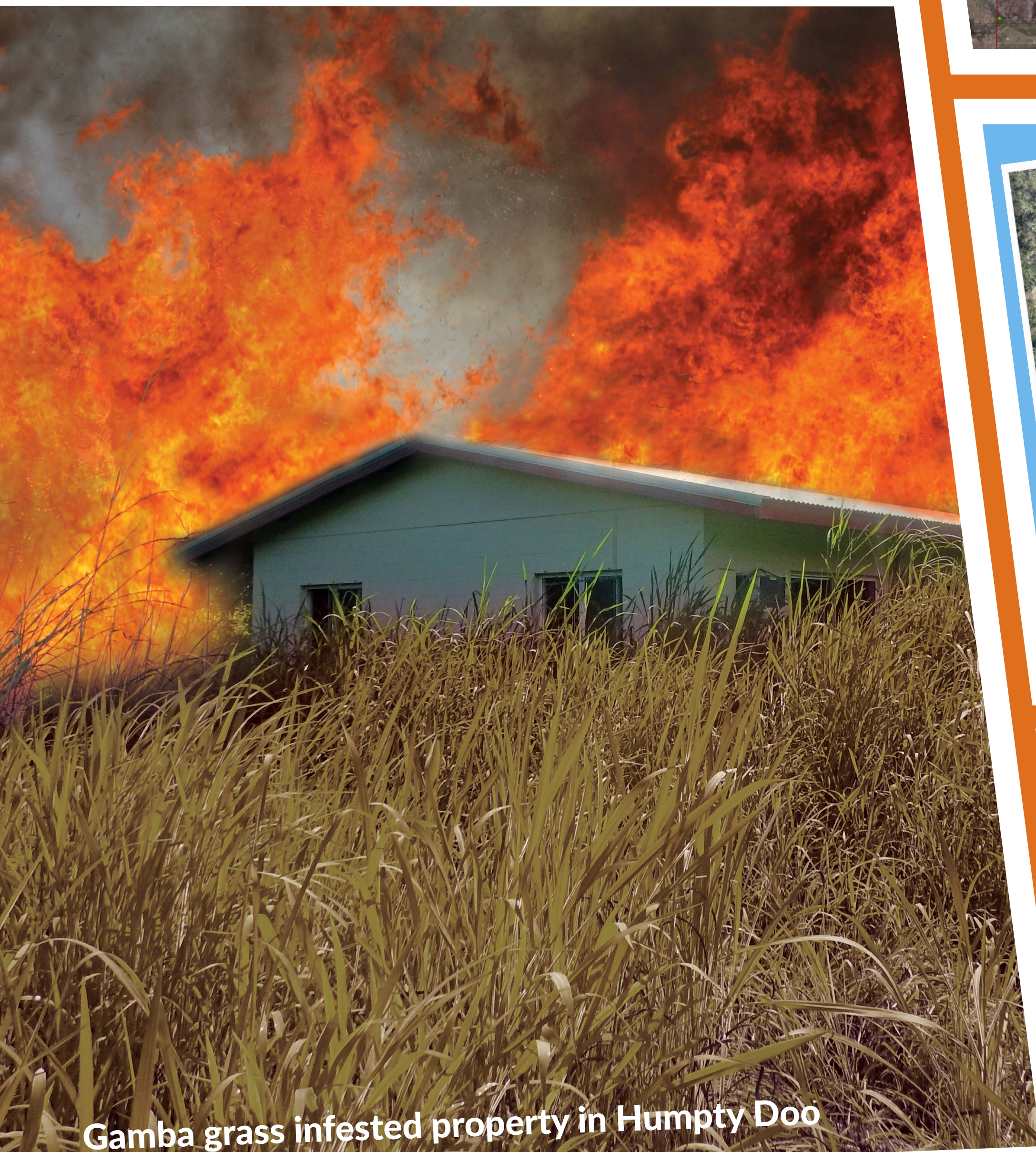
Gamba grass infested property in Humpty Doo

Sometimes enforcement is needed where people refuse to do the right thing.