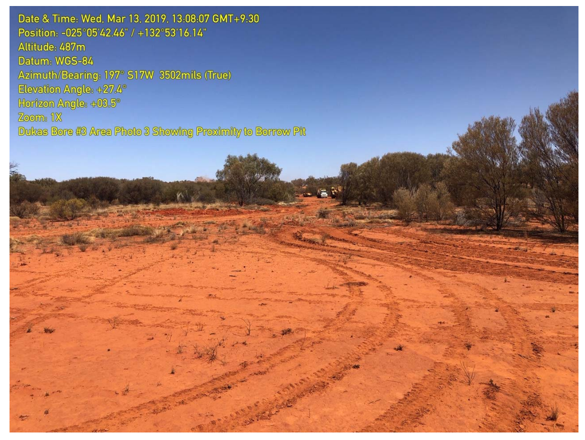
Figure 2: Photos of the proposed third water bore location