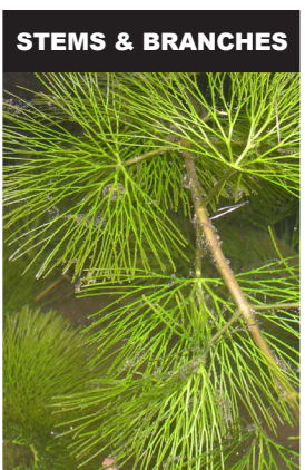
Stems are branched with white or reddish brown hairs growing on them.