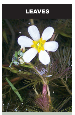
There are two types of leaves. Below the water they have opposite fan shaped leaves that grow on a 3cm stem (right). Above the water they have 2cm elliptical leaves (left).