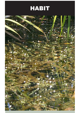
Cabomba is a mostly submerged perennial plant, 2 - 10m long. Plant is usually rooted to the water body floor, but can survive unattached.