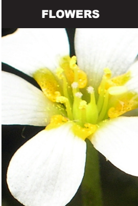
White/yellow flowers are 2cm wide and form on short stems just above the water's surface. Often a pink tinge on their tips. Flowers all year in the Northern Territory.